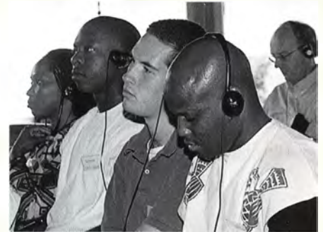
Scholars of the summer program on Conflict Transformation at a conference plenary.

The Co-Chairpersons of the Community Council for Peace and Tolerance of the City of Mitrovica, Kosovo, November 1, 2001