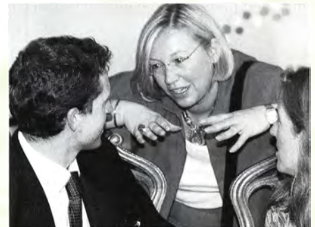
Conference participants meet informally and share their concerns.