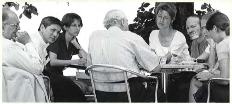
Lively discussion in the park.