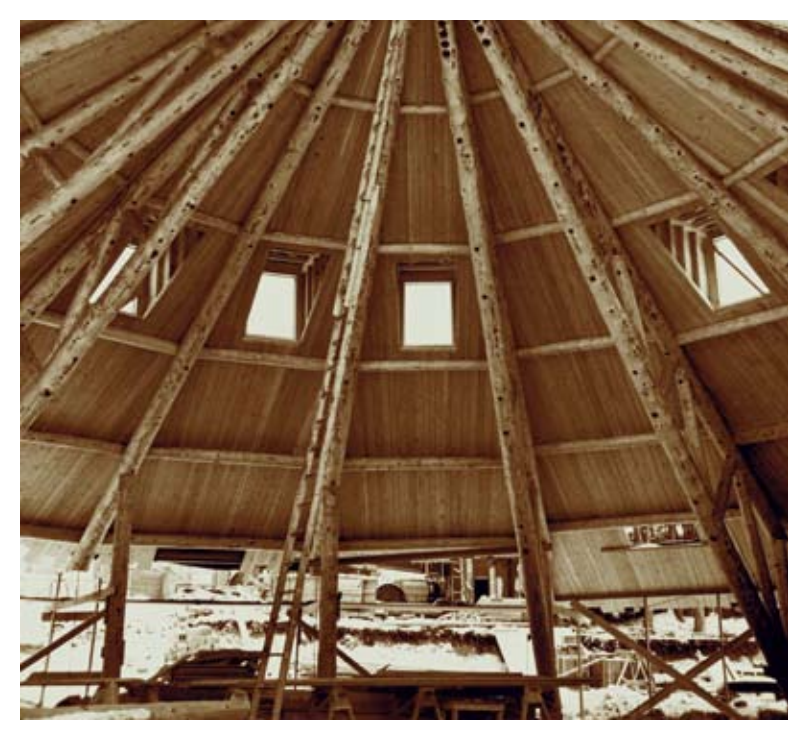
"It's just like my father's tepee: it even has the same number of sticks!" exclaimed the daughter of a Native American chief ...

See the construction of the buildings. Meet the people who gathered here from all over the world. Discover why Mackinac Island has long been a meeting place of peace and inspiration.