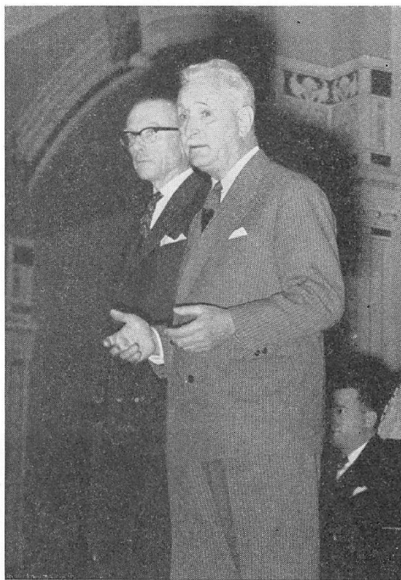
Predecessor of General Speidel, General Marcel Carpentier, who served in North Africa and was Commander-in-Chief of French troops in Indo-China

A British Member of Parliament summed up the effect of the conference as follows: 'At Caux we have seen rebuilt the moral fences which will turn back the flood-tide of Communism and cure the greed and selfishness in the non-communist world which turn millions to Moscow. Men have left Caux with an Easter experience adequate to answer the Kremlin.'