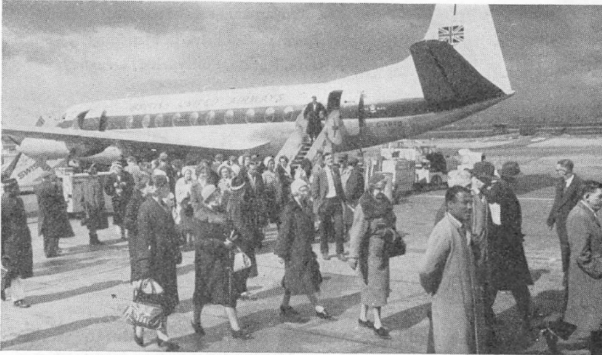
124 British delegates arrive by special planes from Birmingham and from London