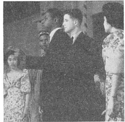
Black and white—Afrikaner and former Mau Mau—from five African nations

Youth leaders from Europe, Asia, Africa and America attend the Conference. Plans were laid to get the MRA film, 'The Crowning Experience,' sweeping through the main cities of Europe. A delegation came from the East End of London where the film opens in Poplar on 16 April