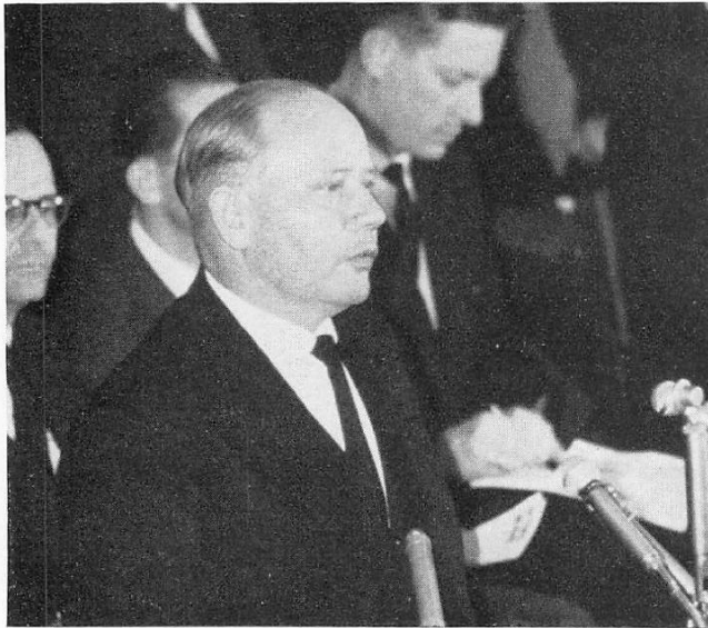
Theodor Blank, German Federal Minister of Labour and Works: 'Chancellor Adenauer has commissioned me to convey the deeply felt sorrow of the German Government and the whole German nation'

GIUSEPPE SARAGAT, Leader, Social Democratic Party of Italy