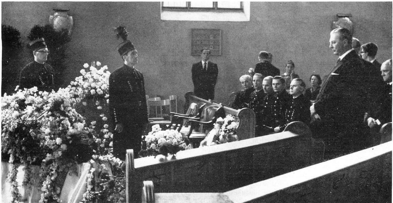
Minister President K. G. Kiesinger, of Baden-Württemberg, stands in silent tribute in the City Church