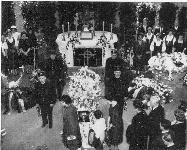
More than 2,000 people file slowly past