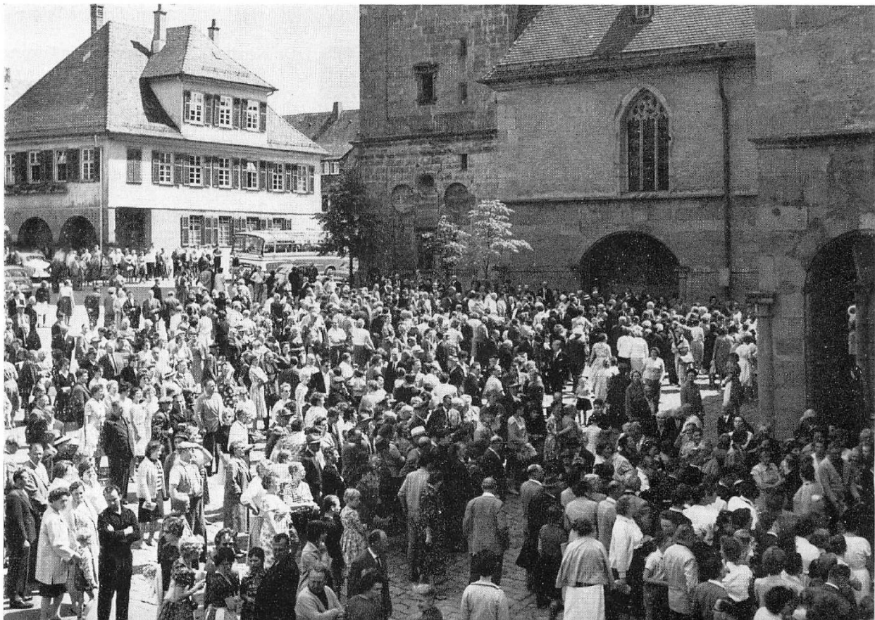
Some of the hundreds outside the City Church, who, unable to get in, heard the service over loudspeakers

General Hans Speidel, Commander of NATO Ground Forces, Central Europe, said in his message, 'The world has lost a frontline fighter for peace in freedom. Germany is one friend the poorer.'