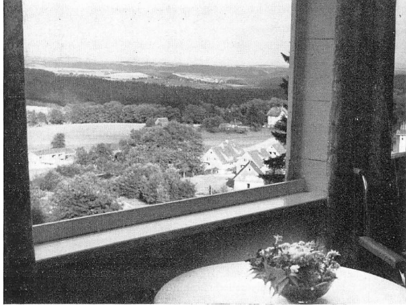
The view of the Black Forest from Dr. Buchman's room

General Ho Ying-chin, former Prime Minister of China, spoke with a 48-man delegation from the Republic of China. Former Mau Mau leaders and Kenya settlers, black and white from South Africa and revolutionary leaders from all parts of the continent pledged themselves to fulfil Dr. Buchman's vision for Africa as 'an answer continent for the world.'