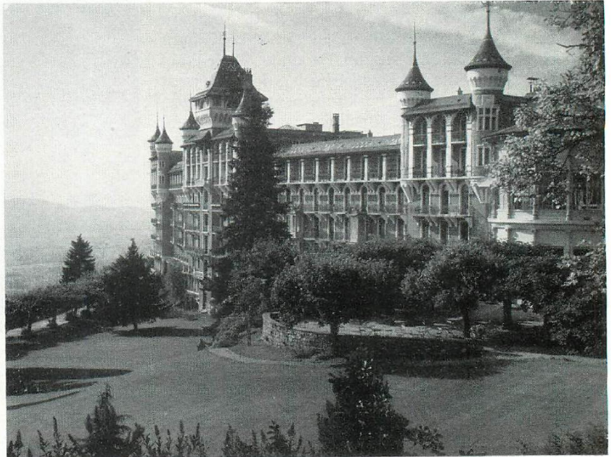
MOUNTAIN HOUSE, CAUX

The Assembly will plan the greatest forward advance in the history of Moral Re-Armament.