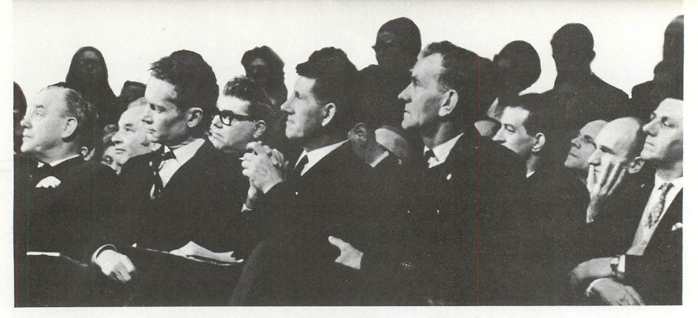
British trade unionists on platform at Arts Centre opening