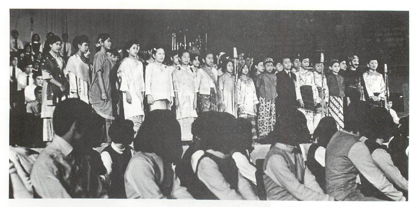
Forty-five Indonesian students present Indonesian folksongs as part of the Japanese musical 'Let's Go '66'. The MRA revue recently played to 12,000 people in the Olympic Stadium and was broadcast nationally on TV.