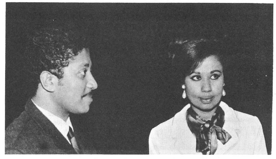
THEIR HIGHNESSES THE SULTAN AND SULTANA OF ZANZIBAR attended a performance of 'It's our country, Jack!' in Southampton