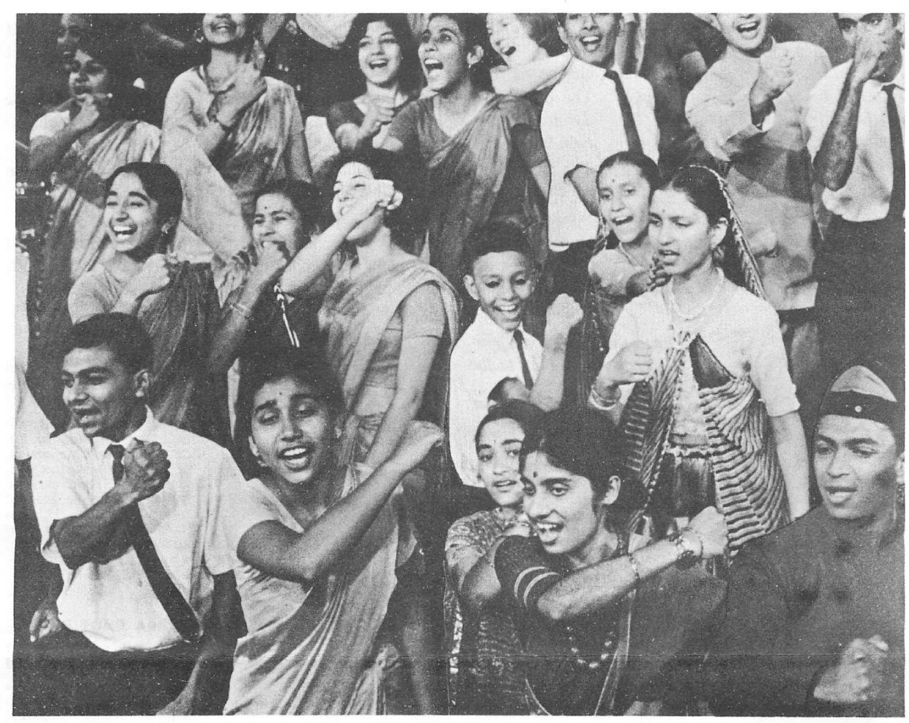
Cast of India

To meet the present crisis a moral awakening which will win co-operation of the widest range of people.