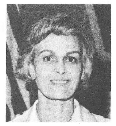
father C B de Mille was fond of quoting:

The Westminster Theatre is continually charged with spreading a 'message', while the other theatre disclaims such a purpose, with what I feel is a rather foolish intellectual conceit, that message stifles art. Frankly it is my impression there is a very powerful message in their theatre and I believe it is entirely the wrong one for a world in desperate need. I remember a little verse my