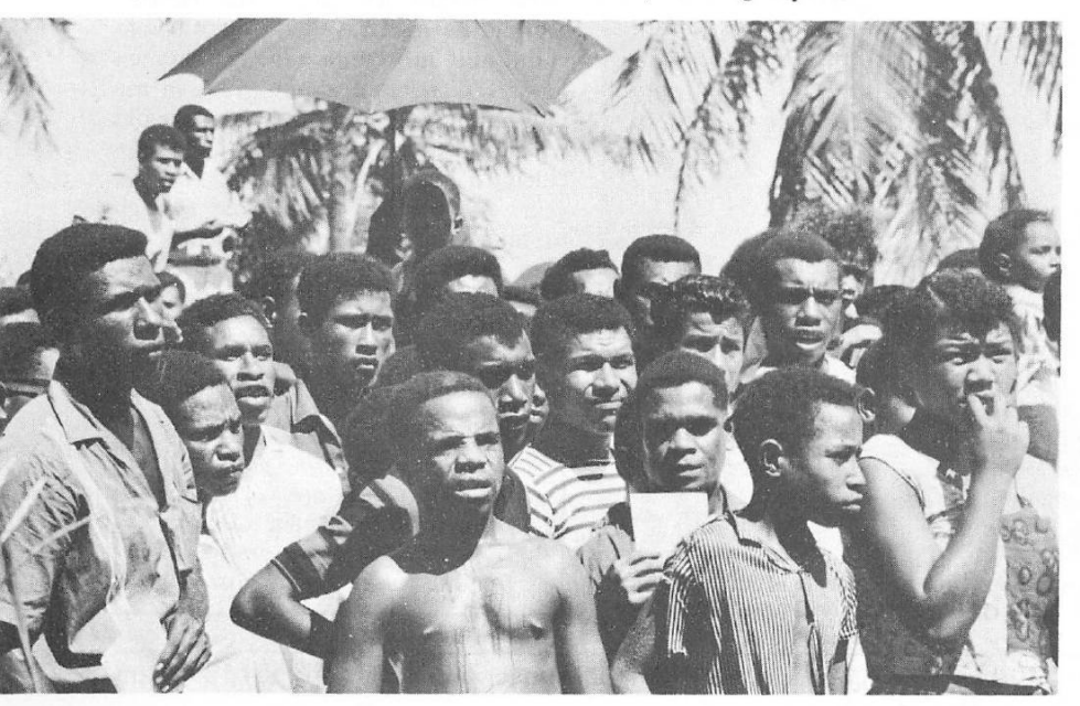
Listening to 'Wake Up, Matilda!' songs in the Koki Market, Port Moresby ph

The Australian and New Zealand MRA musical 'Wake Up, Matilda!' is in Papua-New Guinea at the invitation of Dirona Abe, Papuan Under-Secretary of Health, JOHN WILLIAMS cabled the following report: