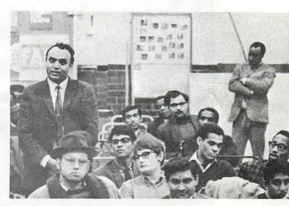
London students ask questions

A student from Afghanistan said that many of the men and women who came to Britain from his country returned sodden with wine, sex and corruption. He would have been the same if he had not come in contact with MRA, but now he saw that there were some people in the West who had a spirit he wanted for Afghanistan.