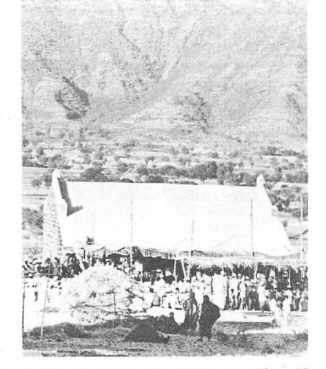
Indian farmers at MRA meeting in Maharashtra

If Moral Re-Armament's work does forecast the future then Britain is heading for an economic miracle and a new role. Suggestive is the fact that the men who have applied Moral Re-Armament in the coal and steel industries, shipping, the docks, Petro-