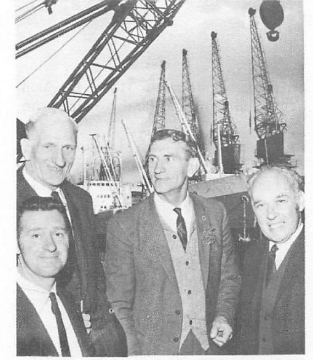
Australian, Dutch and British dockers' leaders meet in London

in The Financial Times , 'This is a story of our own lack of experience of British practice, as much as union intransigence. I have made mistakes.'