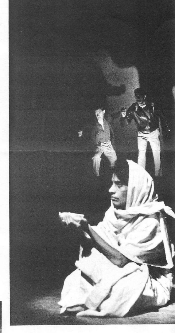
Above: 'Rise the bitter, rise the hateful, rise the needy to our call' sing the people of Weiheit'tiu

What I have seen portrayed on the Caux stage and in the lives of men and women here from all corners of the world could make reality what is expressed in the third act—the creation of a new type of man for East and West.