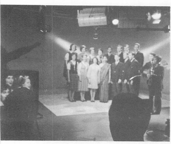
3.59 pm: The cast record for BBC-TV a song they had written specially for Ireland