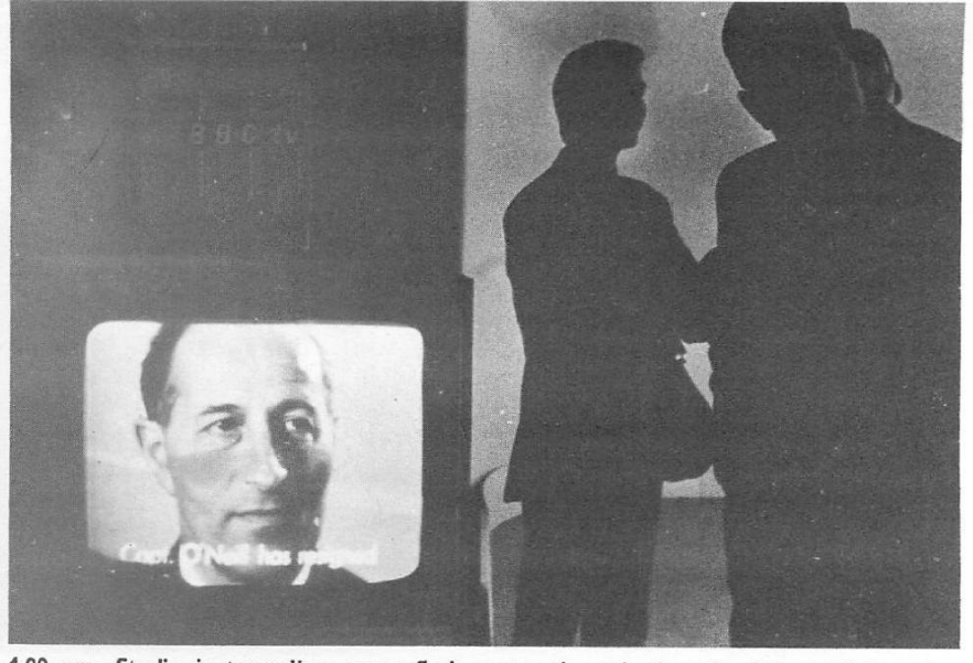
4.00 pm: Studio in turmoil as news flash comes through that the Prime Minister has resigned. The cast wait, as the news goes out, before resuming their recording.