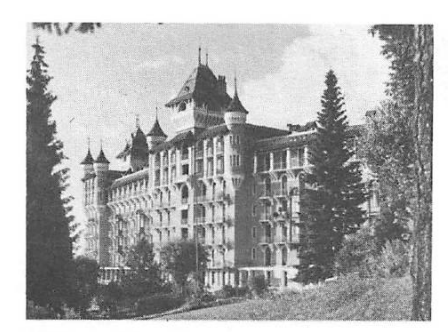
MRA world centre, Caux