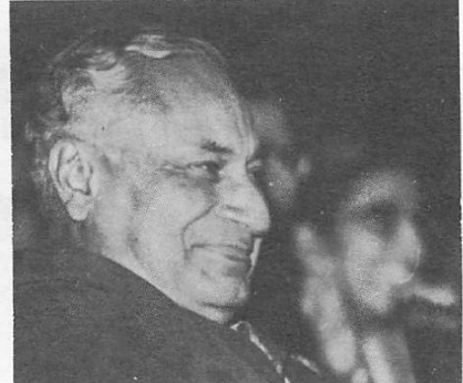
Governor of Assam