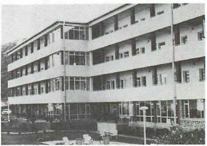
Panchgani: MRA world conference centre

It is not power we should be thinking of, but of what needs doing, and how to do it. Service should be individual caring, so that each person becomes