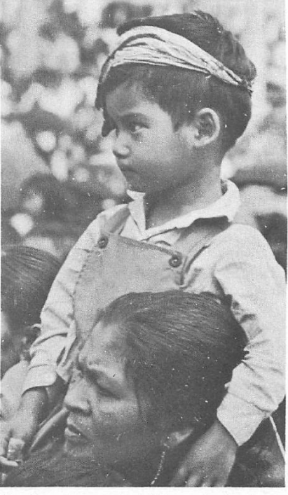
Khasi mother and child watch the inauguration of the new hill state of Meghalaya