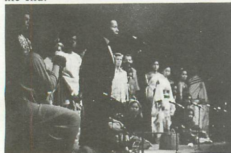
The Laotian Ambassador speaks after the performance of Song of Asia

The occasion also launched the newly published Handbook of Hope . In 70 concise pages it gives the ideas and evidence of MRA, relating 28 specific instances where individuals have applied these ideas and 'broken the chain of wrong'. Copies were eagerly bought at the end.