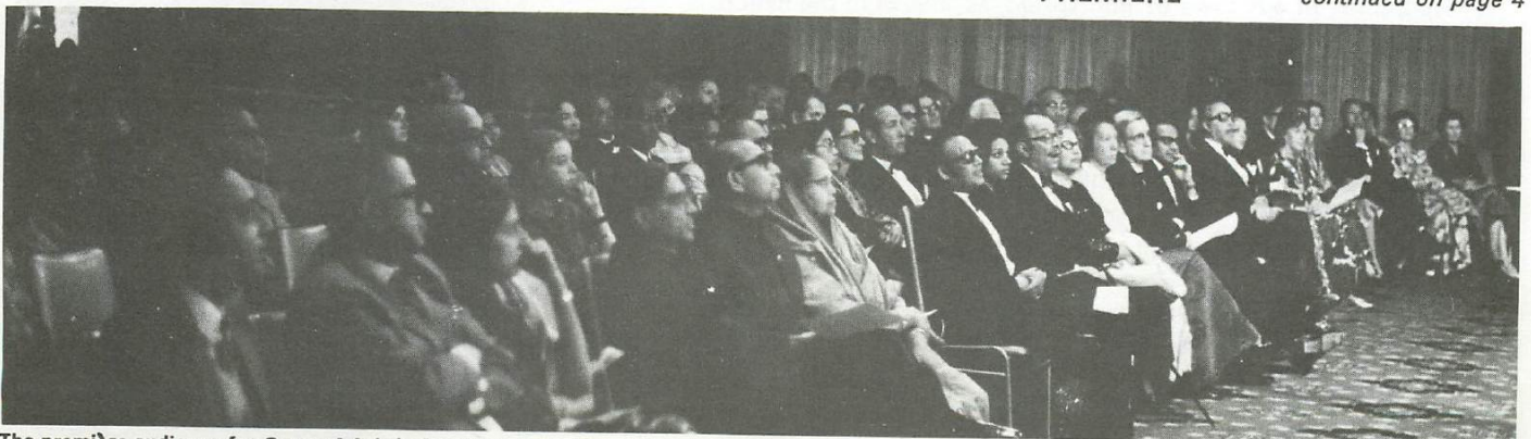
The première audience for Song of Asia in Delhi's Ashoka Hotel Convention Hall