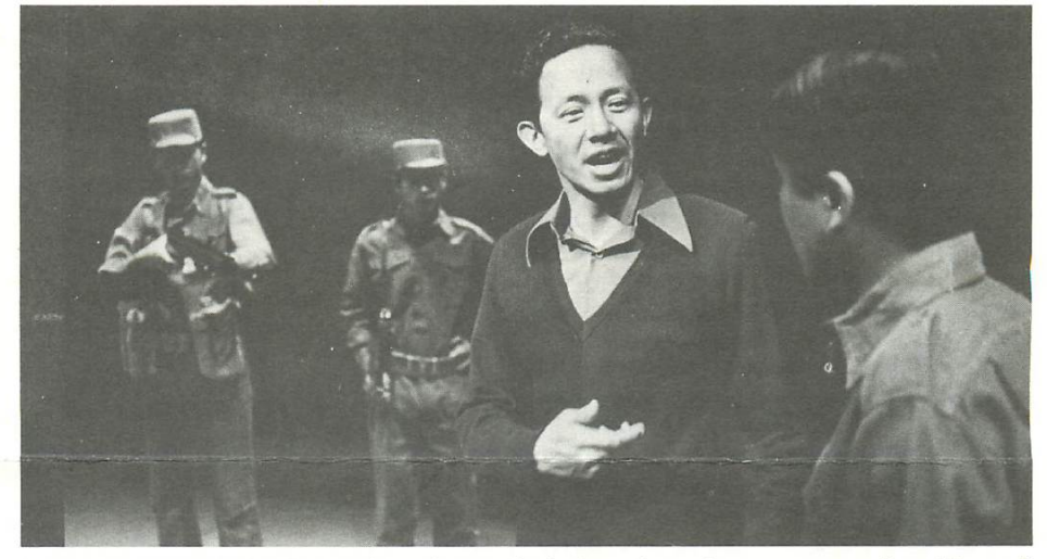
A guerilla leader asks forgiveness from the man he had sought to destroy—a scene from 'Song of Asia'

Pedagogy (Teacher's Training), Than Nor University and a Chinese school.