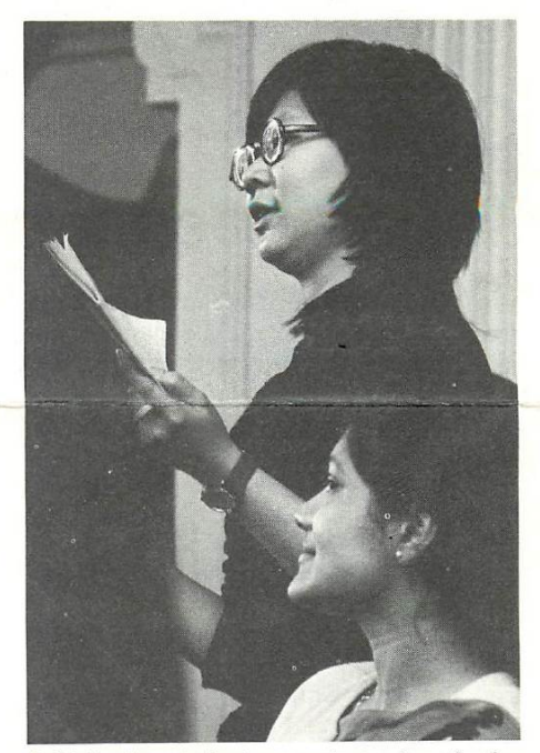
A Malaysian student requests speakers for her university.

A Malaysian student from the University of New South Wales said: 'If we students go on being as corrupt as AUSTRALIA continued on page 4