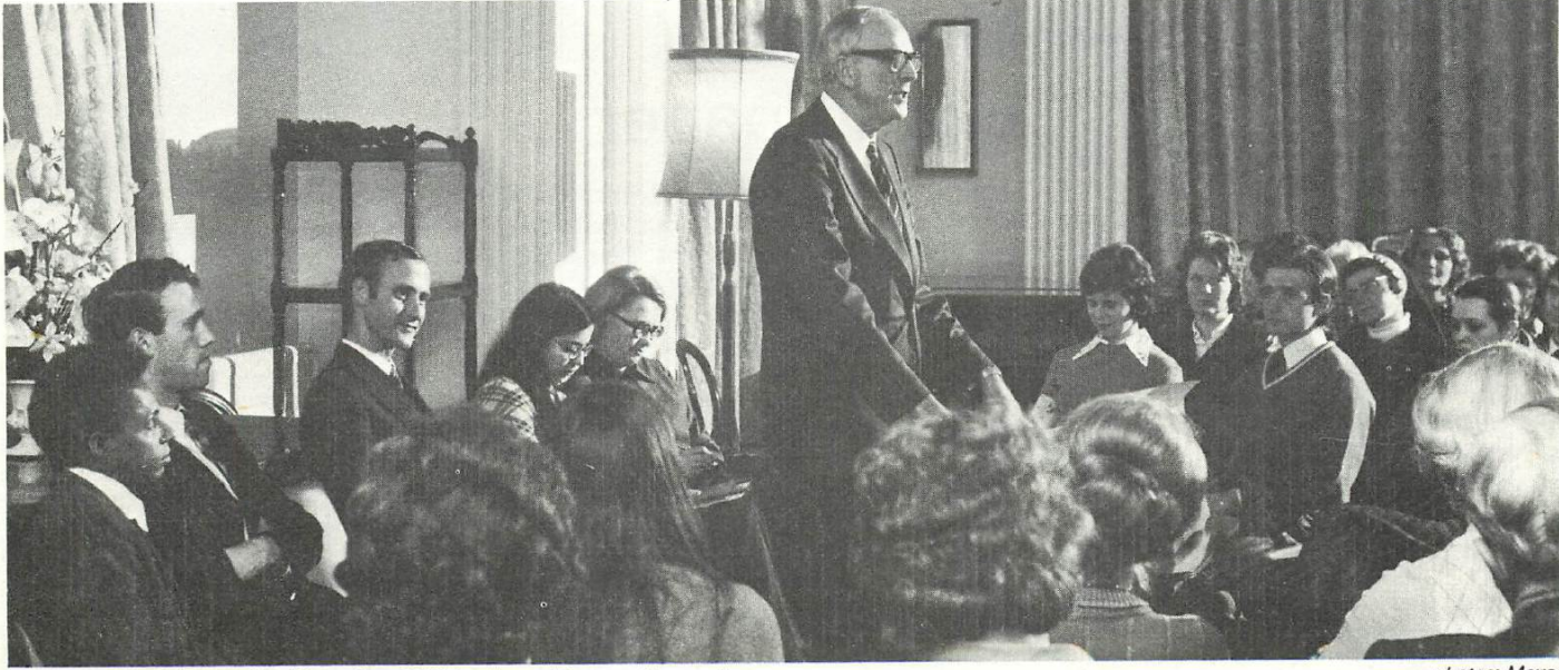
The Australian Minister for Education, K E Beazley, addresses the conference.