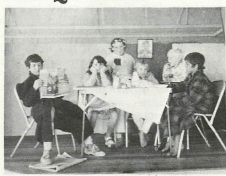
The children write and stage a play

While some modern educators seem at their wits' end about adequately presenting Religious Instruction in schools, pupils of four R I classes in Mitchelton provided their own answers to their schoolmates and parents in Queensland.