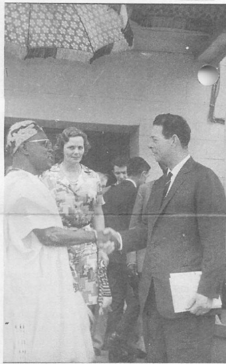
Welcomed to his palace by the Alake of Aberinta Oba Onipede II.

BUILDING A HATE-FREE, FEAR-FREE, GREED-FREE SOCIETY Lagos Conference 28-30 March