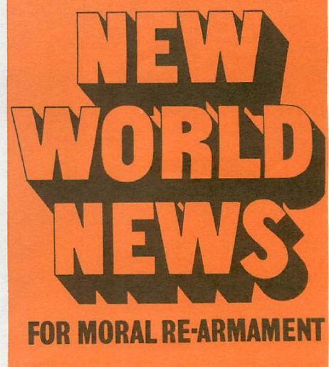
Volume 23 No 35 LONDON 28 JUNE 1975 7p

The following report appeared in Neue Zürcher Zeitung on 9 June: