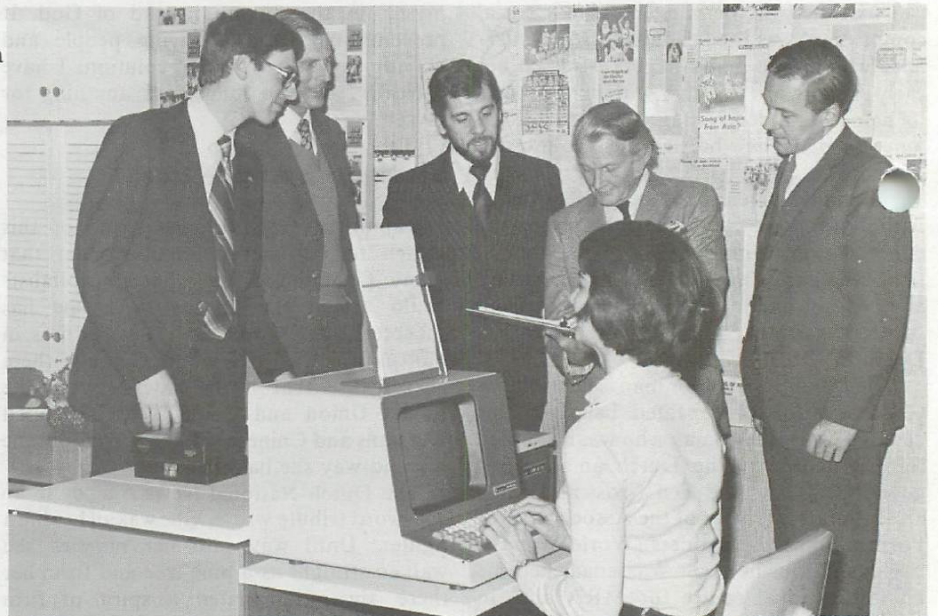
Representatives of New World News and Addressograph Multigraph with the Comp/Set 500 in the editorial offices at 12 Palace Street.