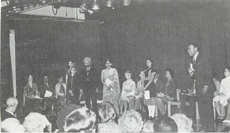
Conrad Hunte introduces the cast of 'Britain 2000'.