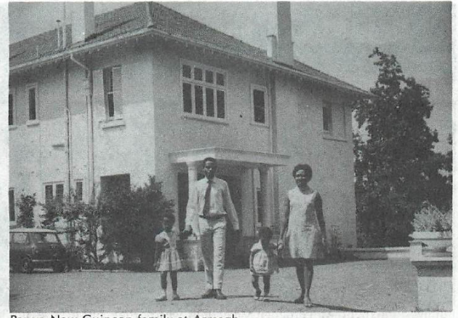
Papua New Guinean family at Armagh