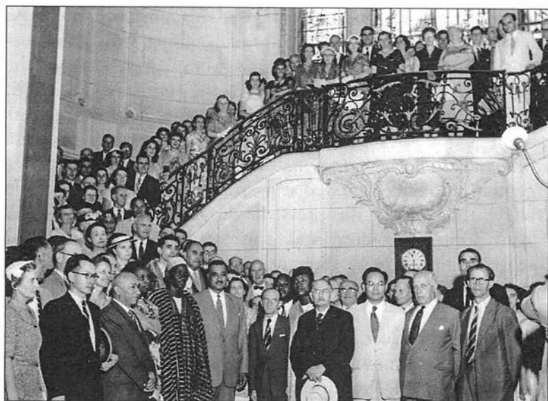
President Nasser (5th from left in front row) with the Vanishing Island group