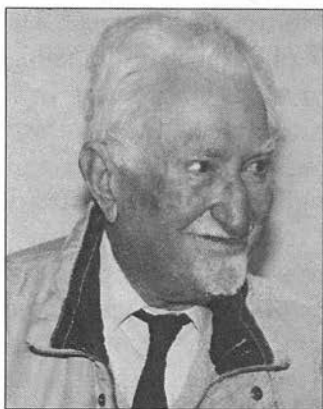
Dr. Fadhel Jamali at age 92