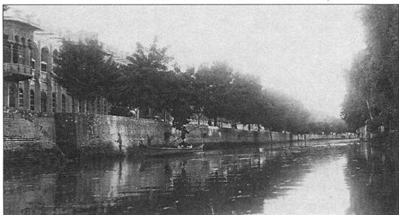
Ashar Creek, Basra 1940s

where the Governor's office and Customs House were located. This section gave its name to Ashar Creek, the largest of the many creeks in the city running into the Shatt al-Arab. Further inland along the creek, was the old city of Basra. The main bazaar or suq was in Ashar, at the point where the creek joined the river near the Customs House.