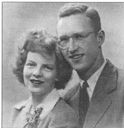
Engagement photo, Lisbon, Dec. 1943