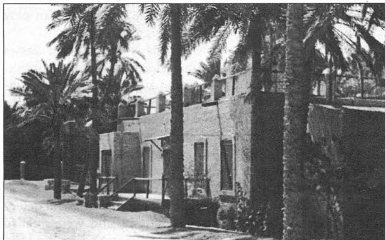
Our home in Basra, 1949