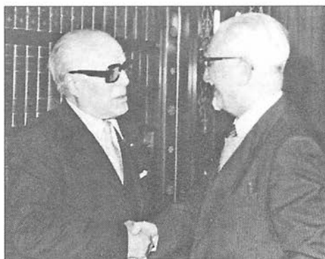
President Bourghiba of Tunisia and Fadhel Jamali