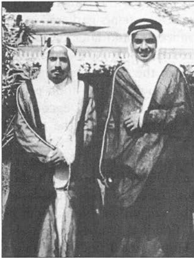
Crown Prince Issa of Bahrain and his brother Sheikh Khalifa