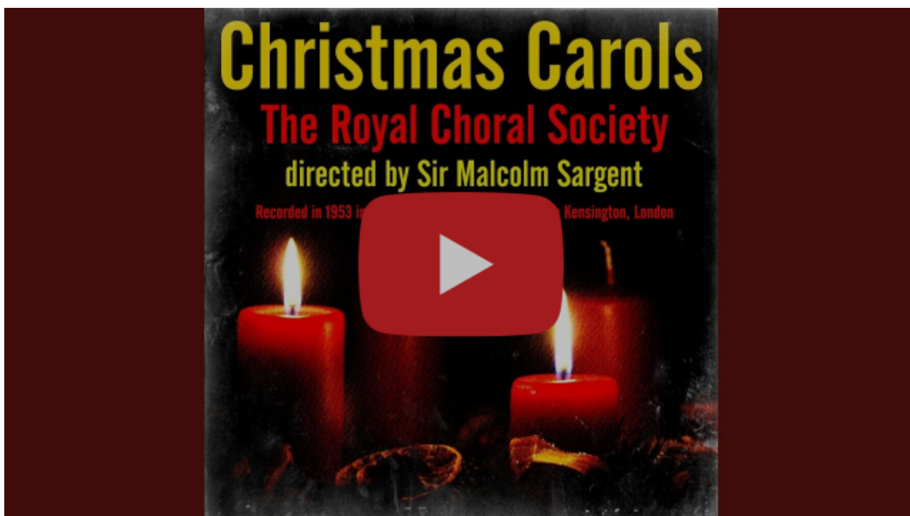
Video above: A Cowboy Carol (feat. Sir Malcolm Sargent). The Royal Choral Society, Sir Malcolm Sargent

The stage version of the story included the song 'Cowboy carol', which had a viral success, becoming a regular feature at Christmas concerts in the Royal Albert Hall in London: