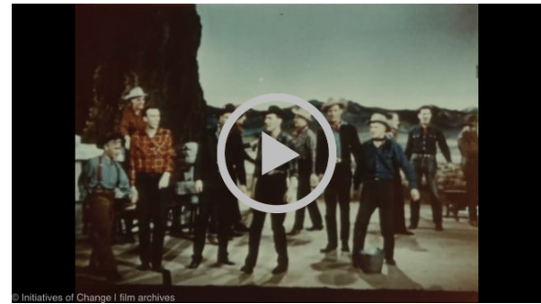
Video above: Jotham Valley, 1952.