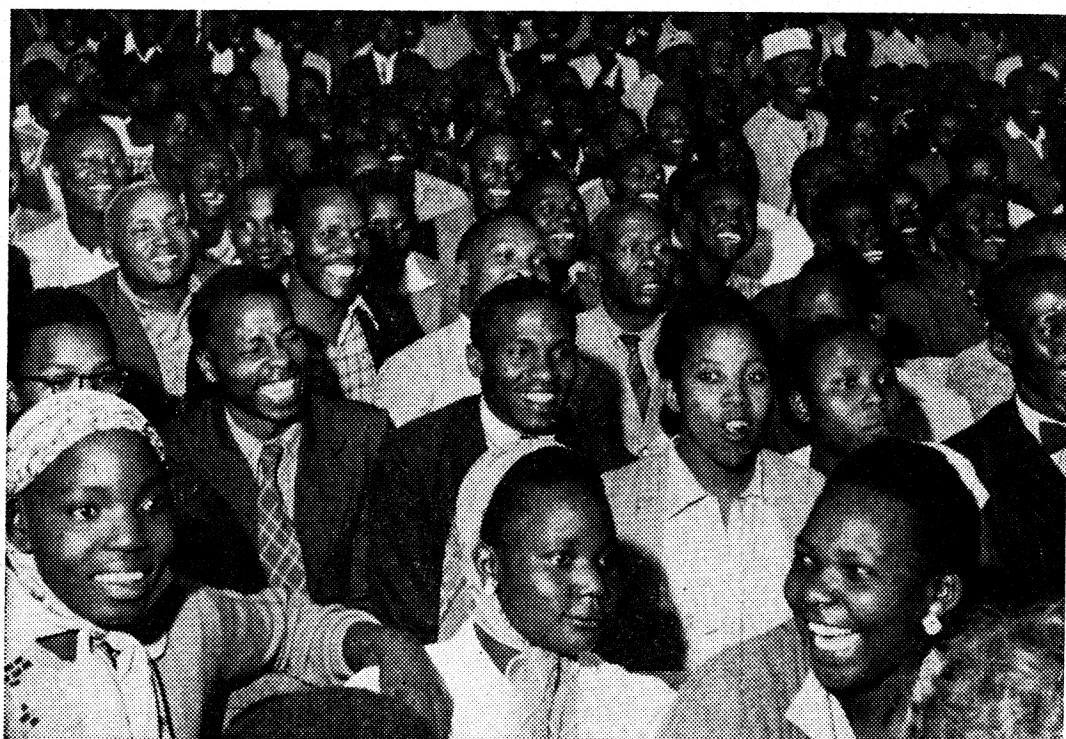
Kikuyus crowd a performance of "The Vanishing Island" in Kenya: the first public gathering since the Mau Mau emergency began. In one rehabilitation camp where MRA men have won back 600 hard-core Mau Mau, the detainees contributed £26 from their 1/- a day wages. These men have now gone out to win back more Mau Mau.