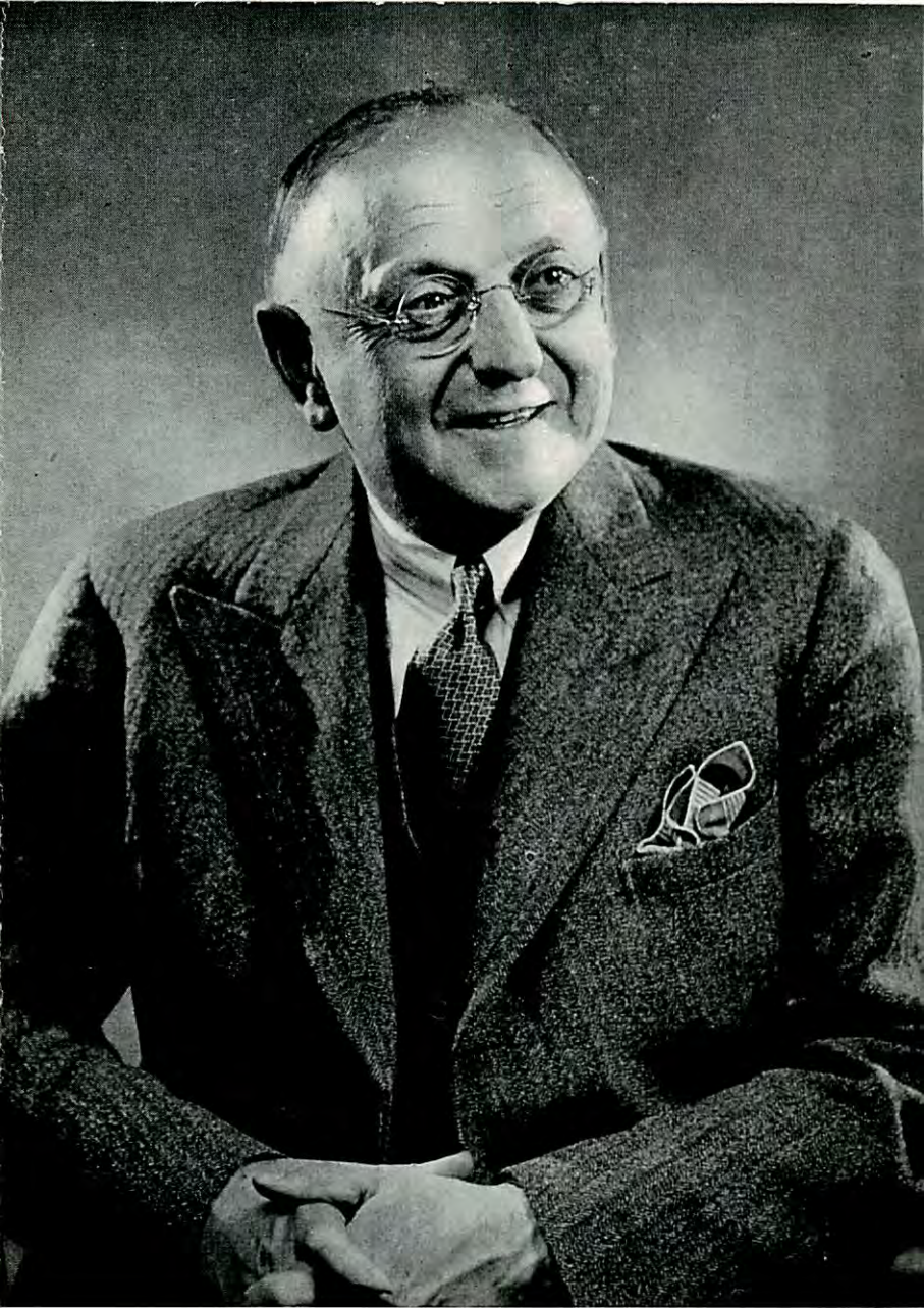
Pioneer of a world that works—Dr. Frank Buchman.