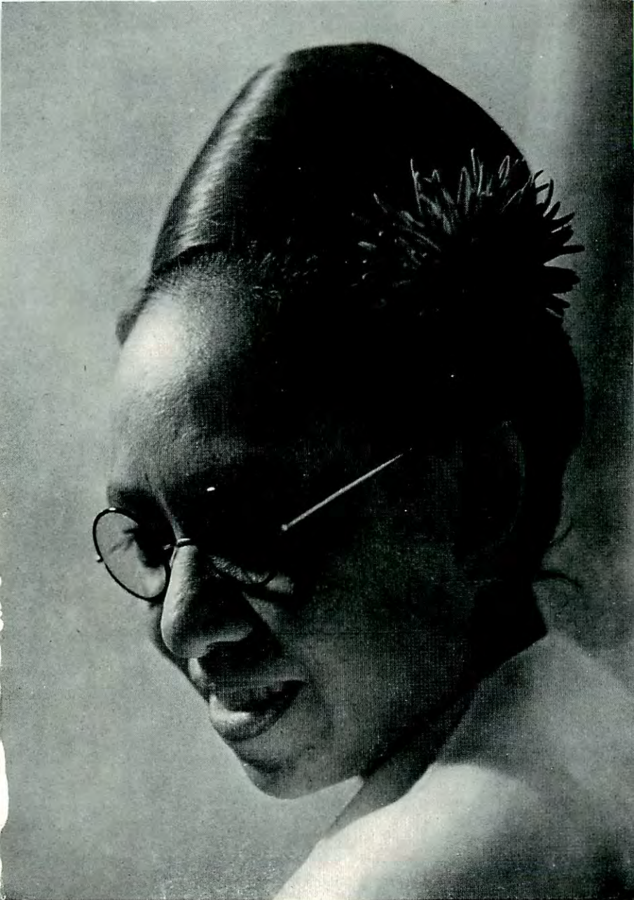
Ma Nyein Tha was fast becoming a national leader. (Page 39) Arthur Strong