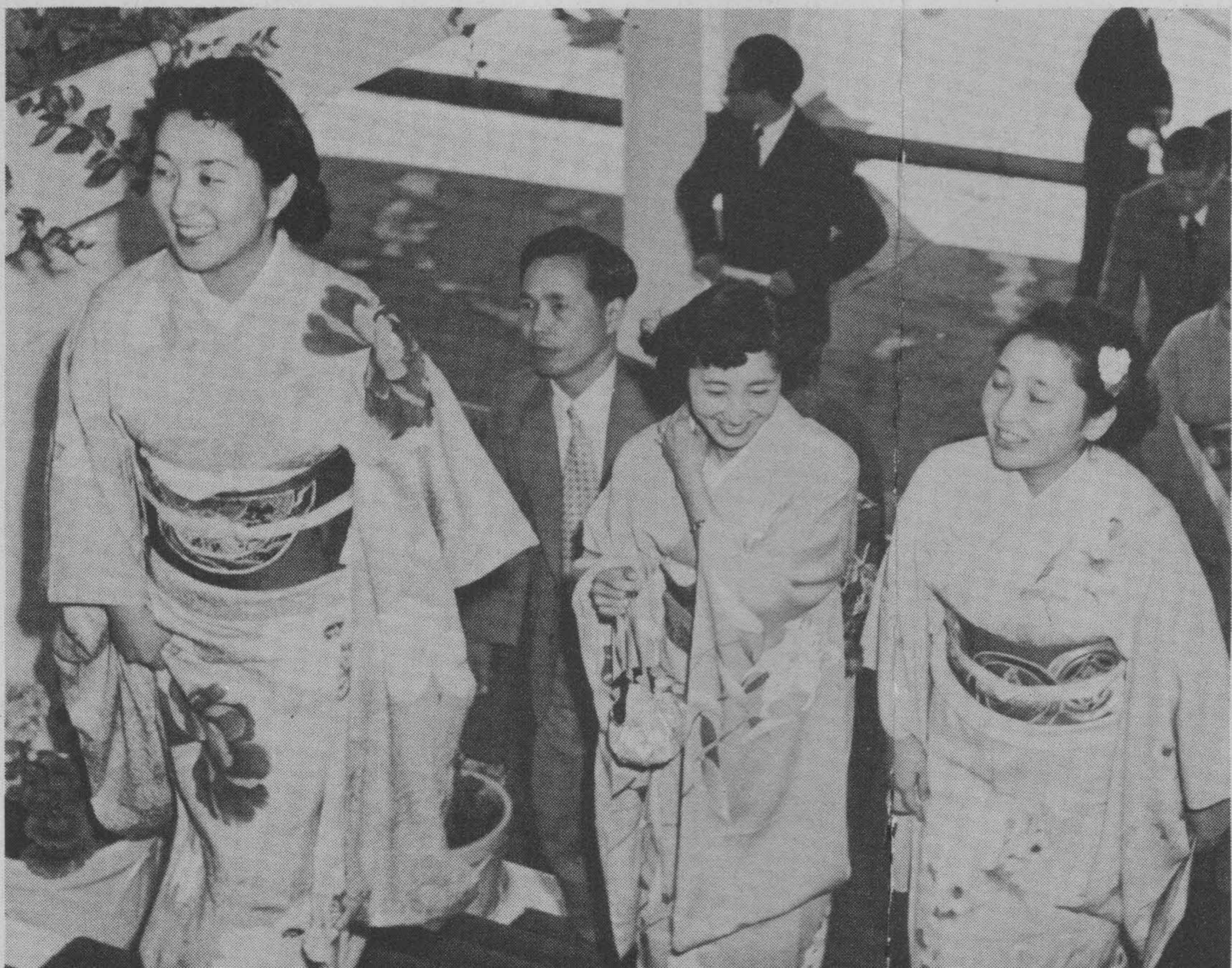
Japanese delegates to 1951 MRA World Assembly, Mackinac Island, Mich.

MRA's budget is streamlined. Its U. S. operations last year totaled one tenth the cost of a single B-36 bomber. With this figure in mind, one Washington congressman who